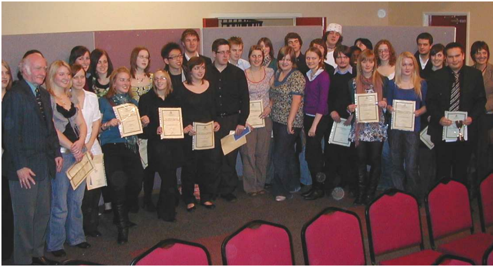
Some of the 43 ex-students who received awards in a ceremony last December.